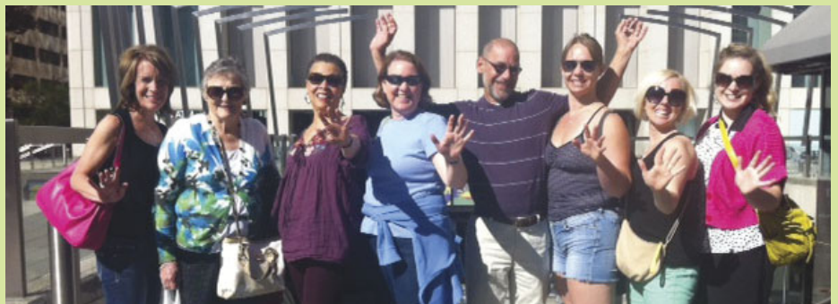
BHN Executive Committee Meets in Denver for Leadership Annual Planning.

By the time you read this welcome, the Executive Committee will have met to set goals for the coming year. I am excited to seeing how the year comes together. I also want to encourage you to get involved with BHN in whatever way works best for you. We are always looking for authors for newsletter articles, speakers for webinars, as well as volunteers to run for office. As always, we are open to suggestions from our members so please feel free to contact me or another member of the executive committee.